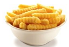
花纹薯条 Crinkle Cut