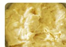
榴莲酱 Durian Paste