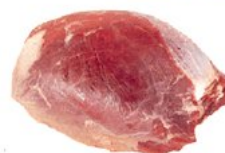
牛腿肉 Beef Knuckle