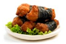
紫菜鸡 Crispy Chicken Seaweed