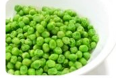
青豆 Green peas