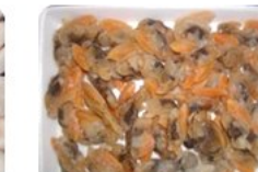
熟啦啦 Frozen Cooked Yellow Clam