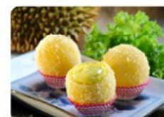
榴莲火球 Durian Fire Ball