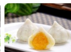
蟹籽鱼包蛋 Crab Roe With Fish Roe Bun