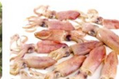
苏东仔 Baby Squid