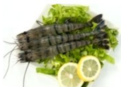
老虎虾 Black Tiger Hosos