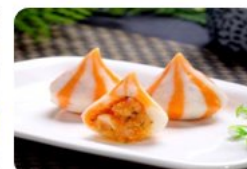
蟹籽沙拉虾 Crab Roe With Salad Shrimp Ball