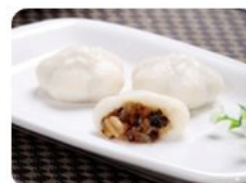
瑶柱海参包 Scallop With Sea Cucumber Bun