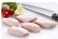
鸡中翅 Chicken Mid Joint Wing