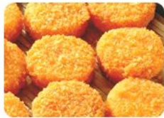
面包带子 Breaded Scallop