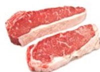
牛腩 Beef Sirloin