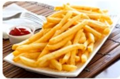
薯条 French Fries