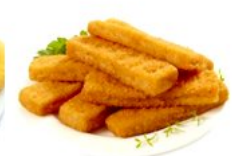
面包鱼 Breaded Fish Finger