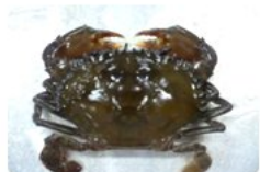
软壳蟹 Frozen Soft Shell Crab