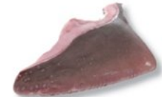
魷鱼 Frozen Stingray 500/1000 Frozen Stingray 1000/2000