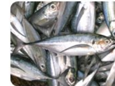
大眼鱼 Frozen Bigeye Scad