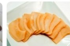
鲍鱼片 Frozen Abalone Sliced