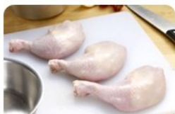
鸡全腿 Chicken Whole Leg