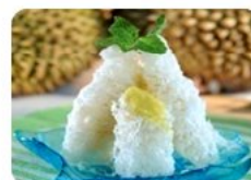
脆皮榴莲卷 Durian Crispy Roll