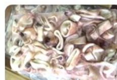
苏东切 Sotong Cut

*Vannamei Hosos, Vannamei PTO, Vannamei PND come in different sizes