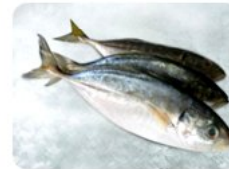
甘邦 (清) Kembong (GG)