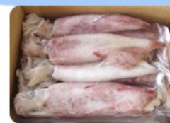
苏东10以上 Sotong Whole Round 10up