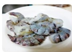
老虎虾肉 Black Tiger PND

*Black Tiger Hosos, Black Tiger PTO, Black Tiger PND come in different sizes