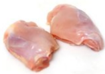
鸡上腿 Chicken Thigh