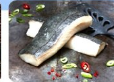
鳕鱼片 Black Cod Fish Fillet