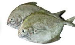
黑鲷 Black Pomfret 100/200(GG & WR) Black Pomfret 200/300(GGS)