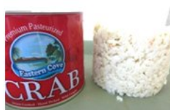
螃蟹钳肉 (罐) Crab Meat Lump (Can) Crab Meat Jumbo Lump (Can)