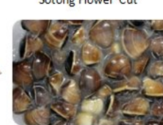
褐色啦啦 Frozen Brown Clam