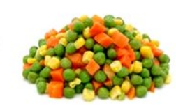
杂豆 Mixed Vegetables