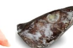
鳕鱼头 (切) Codfish Head (Cut)