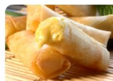
榴莲春卷 Durian Spring Roll