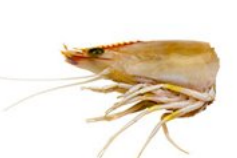
虾头 Sea Prawn Head (Angka)