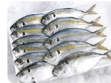
色拉 (清) Selar (GG)