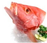
鱼头 Fish Head