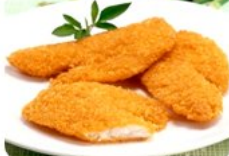
白身鱼 Breaded Fish Fillet