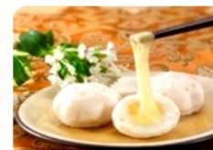
鳕鱼芝士包 Codfish Cheese Bun