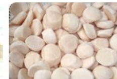
带子 Frozen Scallop