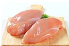
鸡胸肉 Chicken Breast