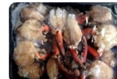
螃蟹钳肉 Crab Claw Meat