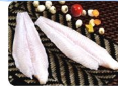
多利鱼 Dory Fillet