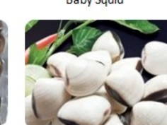
白色啦啦 Frozen White Clam