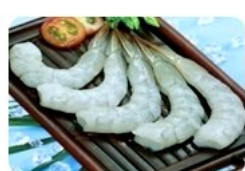
灰虾带尾虾 Vannamei PTO