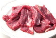
牛肉片 Beef Sliced