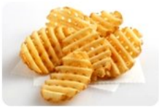
井字薯条 Crisscut Fries