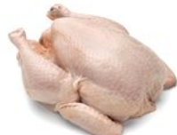
冷冻全鸡 Whole Chicken