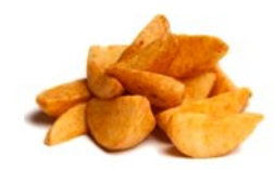
月亮薯块 Potato wedges