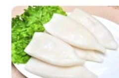
苏东条形 Sotong Tube