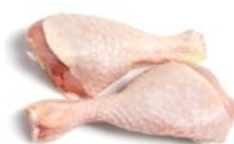
冷冻鸡腿 Frozen Chicken Drumstick