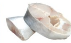
多利鱼片 Dory Steak