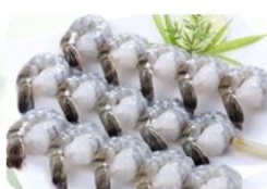
老虎带尾虾 Black Tiger PTO