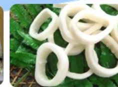
苏东圈 Sotong Ring