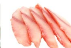
鲨鱼肉片 Shark Fillet