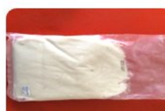
苏东酱 Frozen Sotong Paste