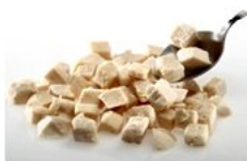
鸡块 Chicken Cube