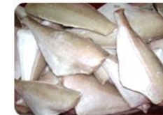
竹仔鱼 Leather Jacket