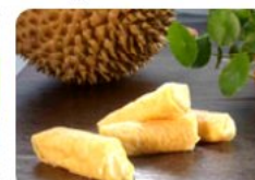
榴莲鸡蛋卷 Durian Pancake