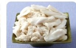
螃蟹肉 Frozen Crab Meat