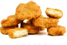
鸡肉麦金鸡 Chicken Nugget