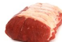
牛扒 Beef Striploin