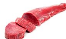
牛肉肌眼 Beef Ribeye