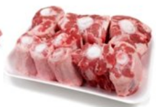
牛尾切 Oxtail Cut