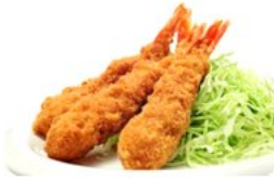
面包虾 Breaded Shrimp