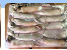
苏东8/10 Sotong Whole Round 8/10