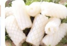
苏东切花 Sotong Flower Cut