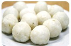
苏东丸 Sotong Ball