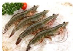
灰虾 Vannamei Hosos