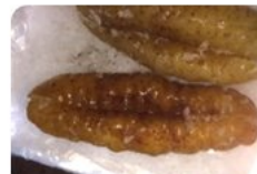
海参 Sea Cucumber