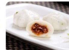
五味章鱼烧 Five Tastes Octopus Bun