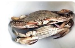
花蟹 Frozen Flower Crab