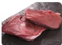
鹿肉 Frozen Deer Meat