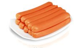
热狗 Hot Dog