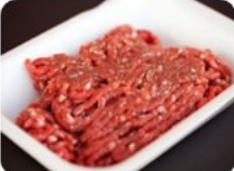
牛肉碎 Minced beef