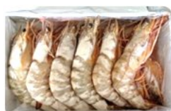
海虾 Sea Prawn Hosos