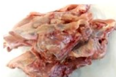
鸡骨 Frozen Chicken Bone