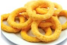
面包苏东圈 Breaded Squid Ring