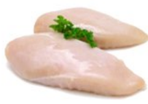
鸡柳 Chicken Fillet