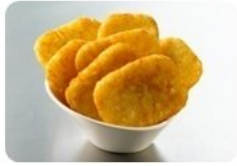
马铃薯块 Hashbrown (Rectangle)