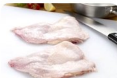
无骨鸡腿 Boneless Chicken Leg