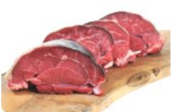
牛健 Beef Sliced