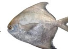
斗鲷鱼 Chinese Pomfret