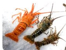
龙虾 Frozen Lobster