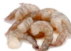
灰虾肉 Vannamei PND

*Vannamei Hosos, Vannamei PTO, Vannamei PND come in different sizes