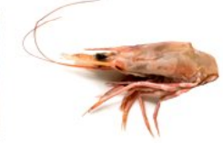
虾头 Sua Lor prawn head