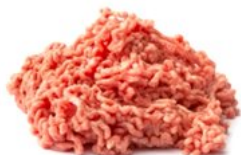
鸡肉碎 Chicken Minced