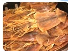
鱿鱼干 Dry Cuttlefish

*Black Tiger Hosos, Black Tiger PTO, Black Tiger PND come in different sizes