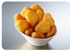
三角形薯块 Hash brown (Triangle)