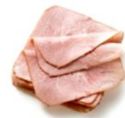
火腿 Chicken Ham