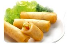
小春卷 Spring Roll