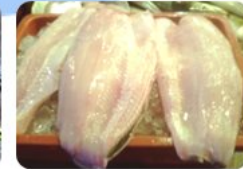
多曼鱼片 Fresh Toman Fillet