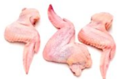
鸡翅 Chicken Wing