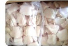
多利鱼块 Dory Cube