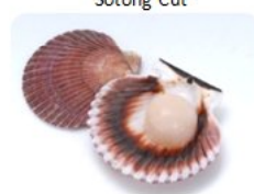
半壳带子 Half Shell Scallop