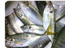
黄鱼 (清) Kuning Fish (GG)