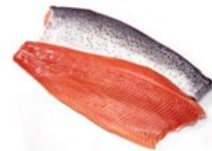
三文鱼片 Salmon Fillet